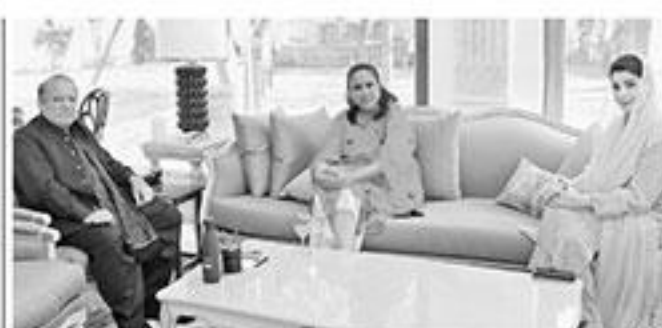
LAHORE: Indian journalist Barkha Dutt with former prime minister Nawaz Sharif and Punjab Chief Minister Maryam Nawaz, Monday.

All the SIMs registered in the names of deceased persons will start blocking from October 16. The SIMs registered in the names of deceased persons can be transferred under the proof of relationship. It should be noted that before 2017 SIMs issued on expired ID cards have already been deactivated while around 70,000 SIMs registered with canceled or fake ID cards have also been blocked.