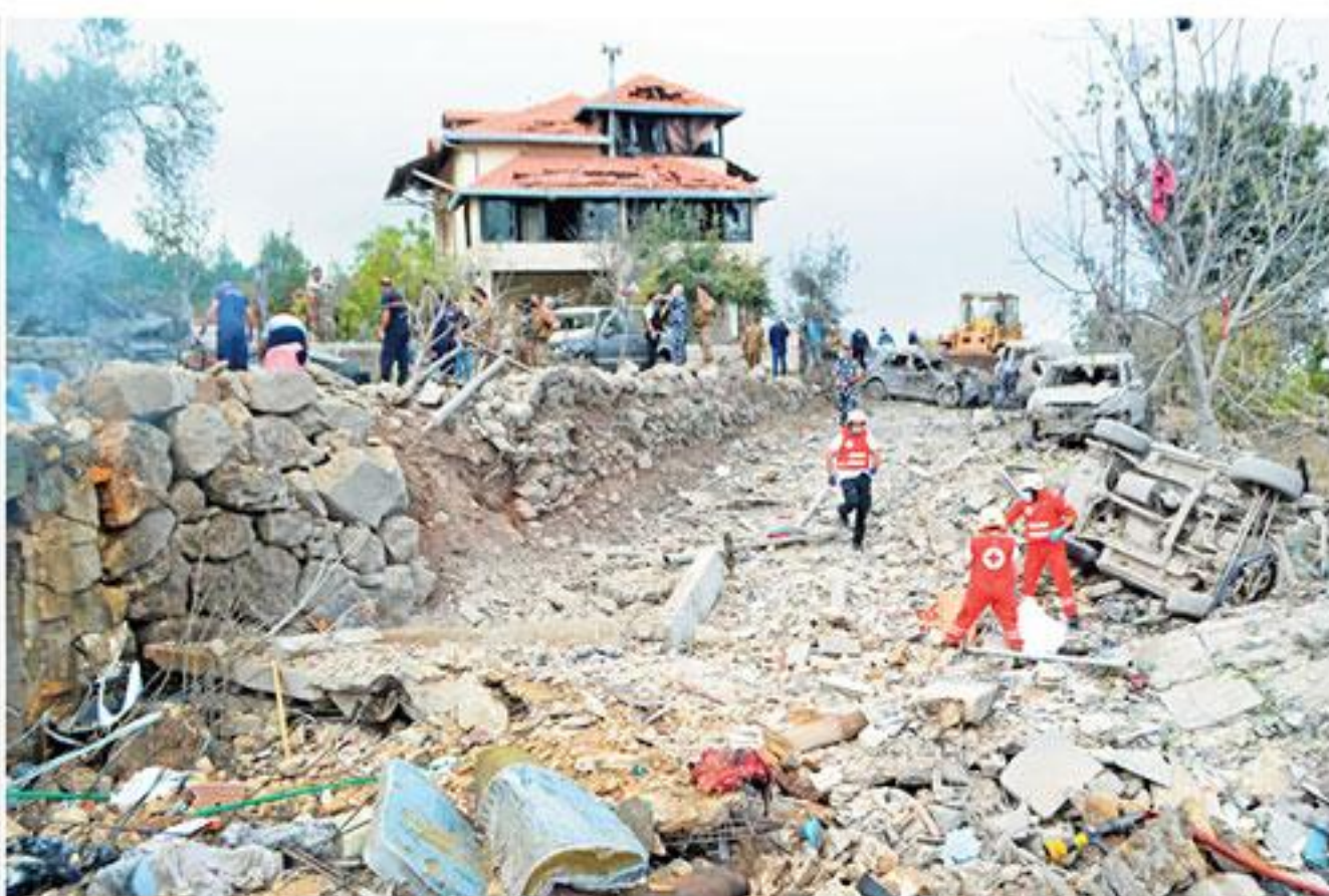
BEIRUT: Paramedics with the Lebanese Red Cross unearth a body from the rubble at the site of an Israeli airstrike that targeted the northern Lebanese village of Aito here on Monday.

Among the activities undertaken by Russia were "reconnaissance of German arms deliveries to Ukraine" as well as surveillance of military training and armaments projects, she said. —AFP