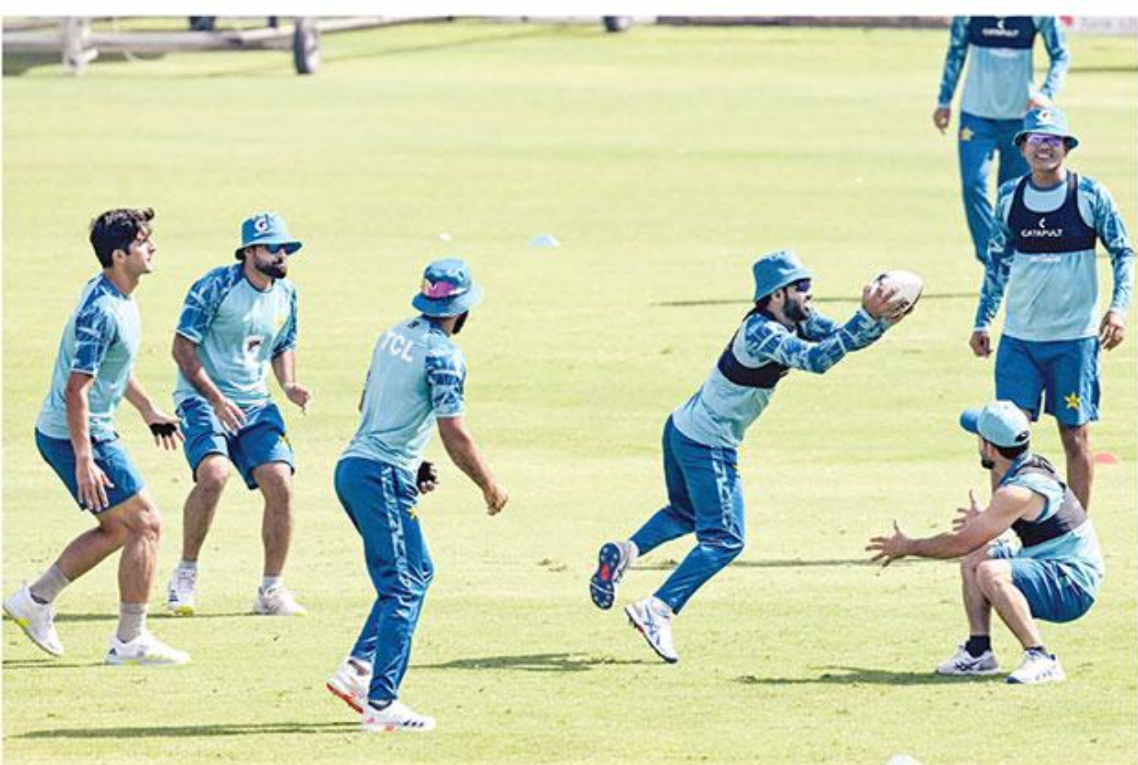
MULTAN: Pakistan's Mohammad Rizwan (third right) attends a practice session with teammates here on Monday on the eve of their second Test against England at the Multan Cricket Stadium