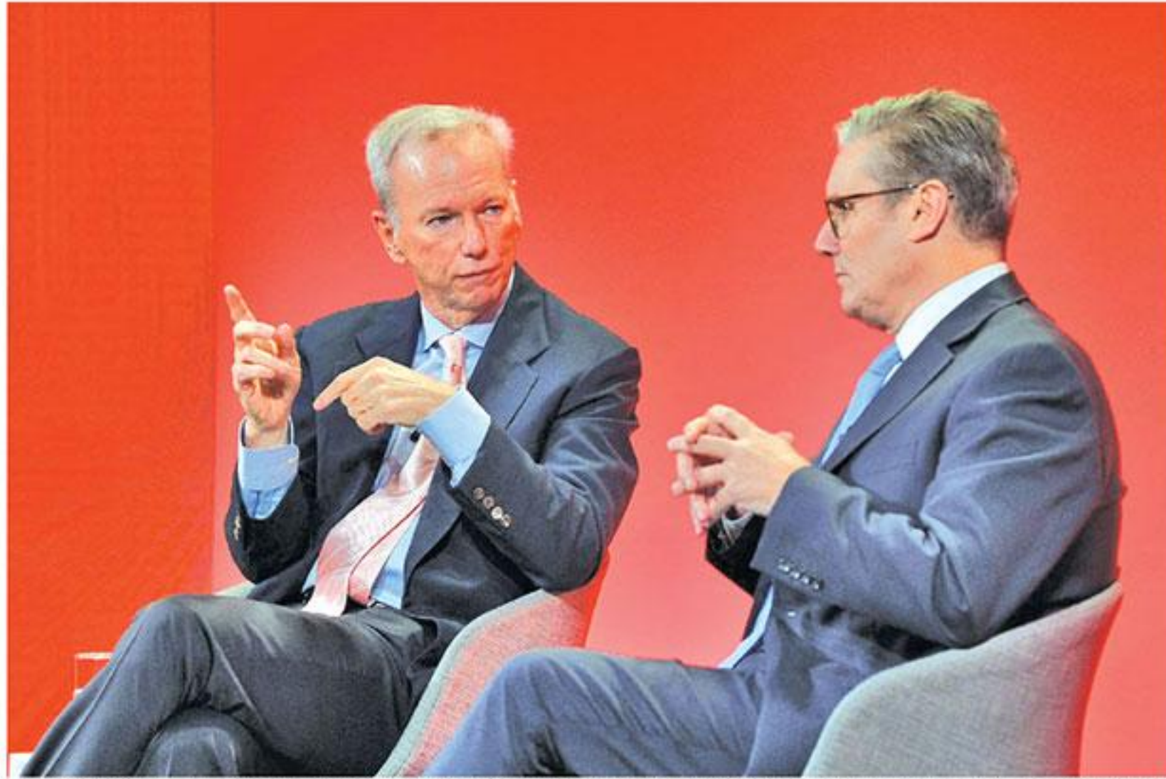
LONDON, UK: UK Prime Minister Keir Starmer in conversation with former CEO of Google, Eric Schmidt and Dame Emma Walmsley the CEO of GSK (not pictured), during the International Investment Summit in London, as the government seeks to woo investors to the UK.

Starmer said he was "determined to repair Britain's brand as an open, outward-looking, confident trading nation" —News Desk