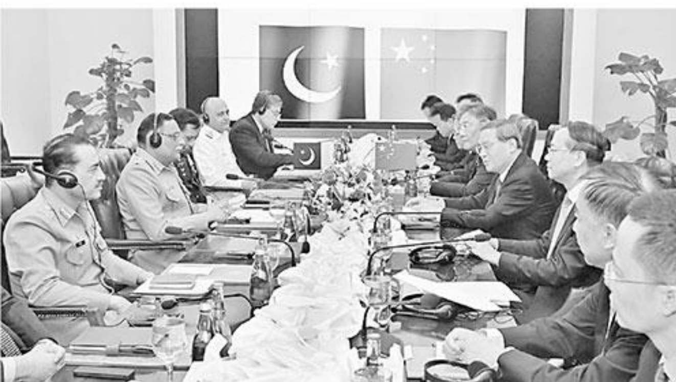
ISLAMABAD: Chinese Premier Li Qiang holding an important meeting with the military leadership, including CJCS General Sahir Shamshad Mirza and COAS General Asim Munir, Monday.