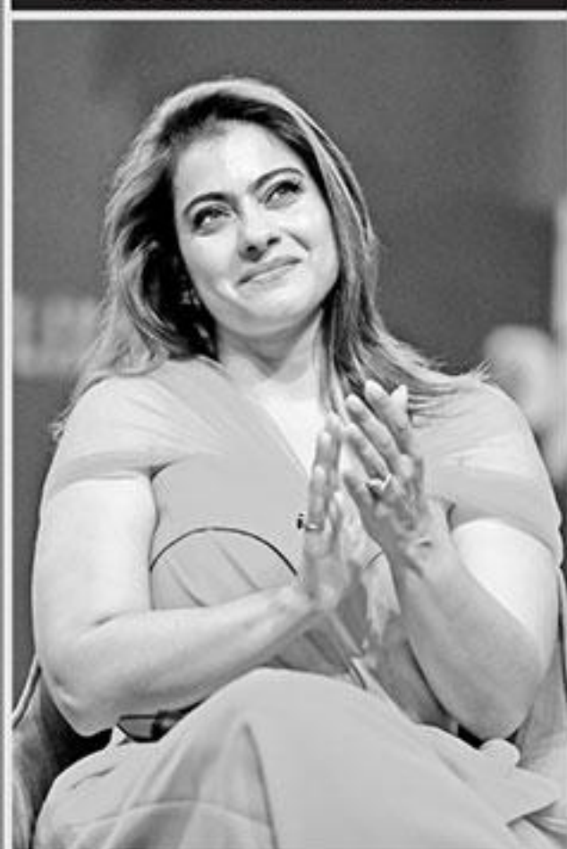
MUMBAI: Bollywood actress Kajol Devgan attends the trailer launch of her Netflix Indian Hindi-language thriller film 'Do Patti' here on Monday.