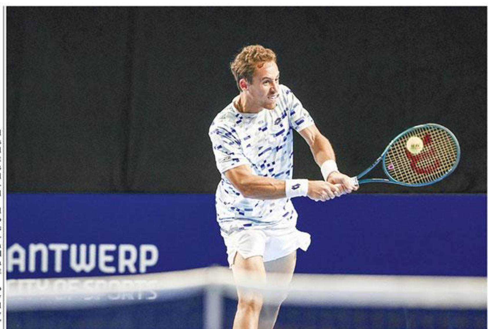
ANTWERP: Spain's Roberto Carballes Baena hits a return to Germany's Dominik Koepfer during their round of 32 match at the ATP European Open Tennis tournament here on Monday

"If CAF know their job, Libya ought to be banned from international football," he told AFP. "This is a high-risk country and one really wonders who approved for Libya to be playing their games at home." —AFP