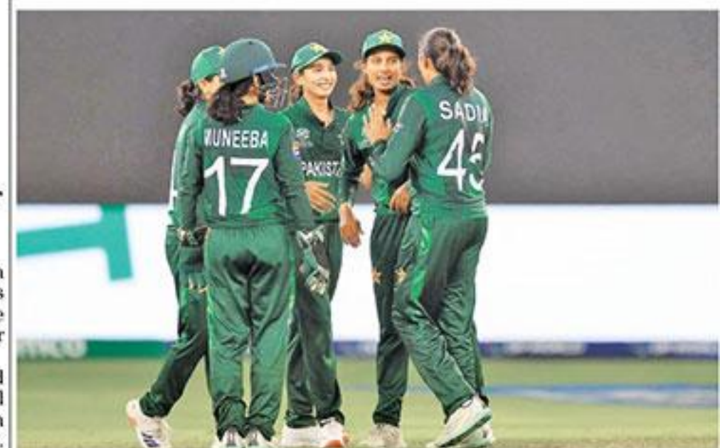
DUBAI: Pakistan players celebrate after taking the wicket of a New Zealand batter during their ICC T20 World Cup match at the Dubai International Cricket Stadium here on Monday

The PCB has asked Fakhar Zaman, who is a centrally contracted player, to reply by October 21.